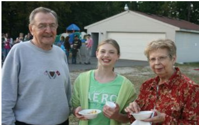
Apple Fest was a wonderful evening of fun and fellowship! Many thanks to the PTO for their hard work to make it a great success!